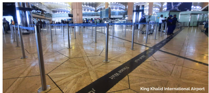
King Khalid International Airport