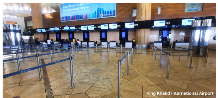
King Khalid International Airport

Please note: Images are for illustrative purposes only. Local specification for India may vary.