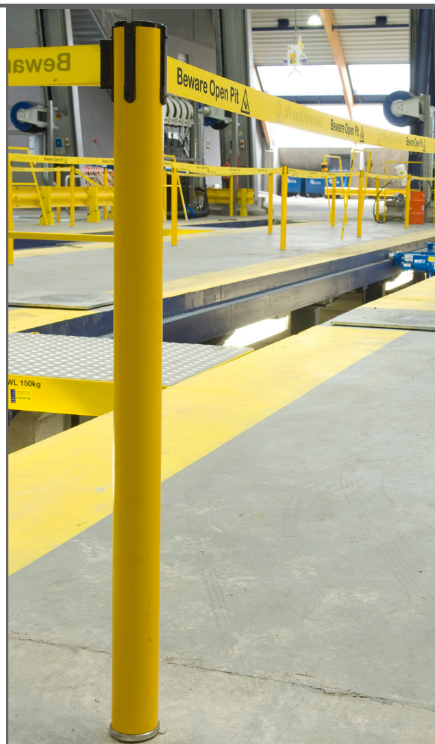
3.65m Pit Protection Post